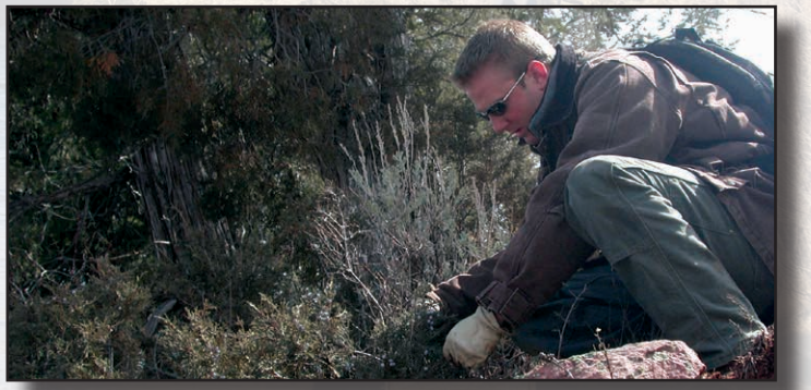
Detailed stream corridor analysis

SFG conducting a recent fish population survey