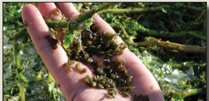
CFI's Freshwater Shrimp nursery