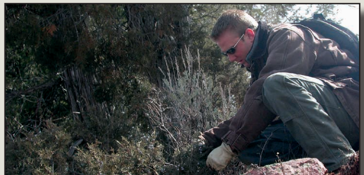
Detailed stream corridor analysis