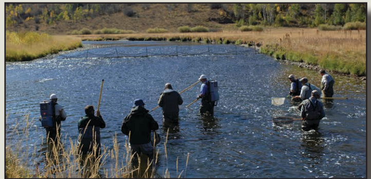
CFI conducting a fish population survey