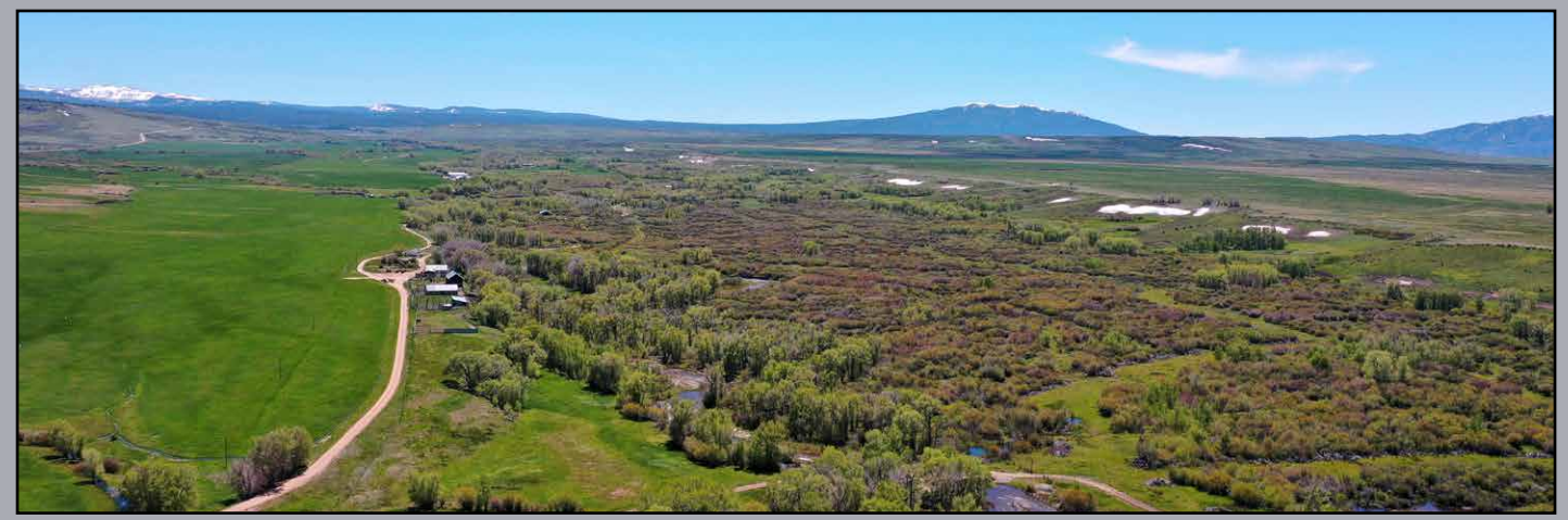
Medicine Bow River, Elk Mountain WY

Traditionally considered an irrigation and livestock watering benefit with angling a distant afterthought, this particular reach was burdened with a lack of in-stream habitat, detrimental historical land practices and very diffucult access to most areas. Sweetwater went to work protecting the prior use needs along with installing new