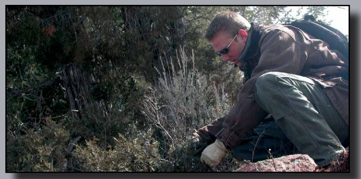
Detailed stream corridor analysis

Sweetwater conducting a fish population survey