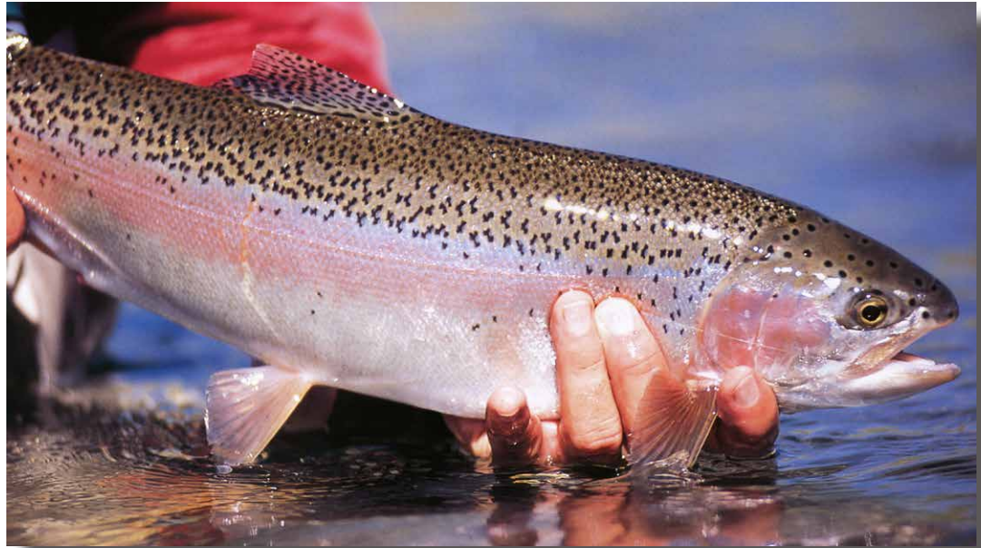
SFG Biologist Toby Stuart sampling on the Roaring Fork River